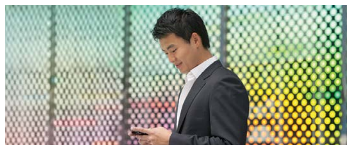
IFRS 15 for sectors