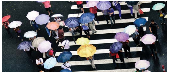
Insurance contracts (under development)