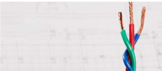
Business combinations and consolidation