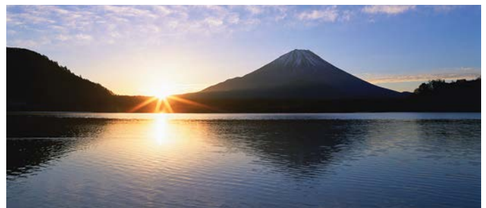
Presentation and disclosures