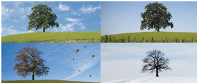
Newly effective standards

Guides to financial statements Illustrative IFRS disclosures and checklists of currently effective requirements.